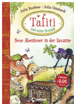
Tafiti and His Friends - New Adventures in the Savannah (Vol. 4-6)