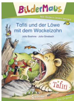
PictureMouse - Tafiti and the Lion with the Wobbly Tooth