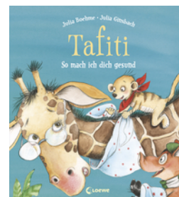
Tafiti – That's How You Get Well