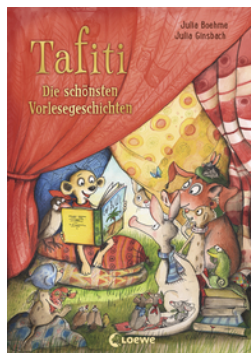
Tafiti – The Best Story Time Adventures for Reading Together