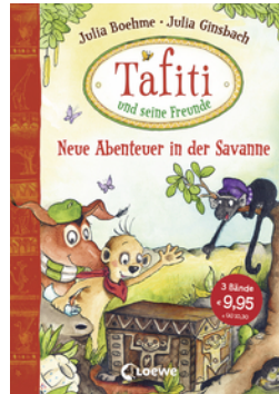
Tafiti and His Friends - New Adventures in the Savannah (Vol. 4-6)