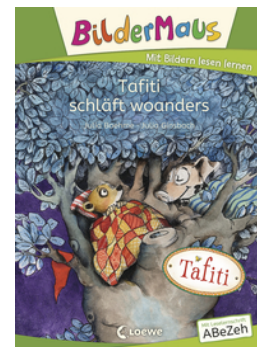
Picture Mouse - Tafiti Sleeps Somewhere Else