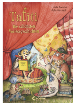
Tafiti – The Best Story Time Adventures for Reading Together