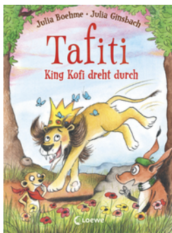
Tafiti – King Kofi Goes Crazy