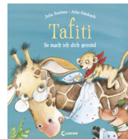
Tafiti – That’s How You Get Well