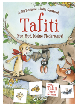
Tafiti – Be Brave, Little Bat!