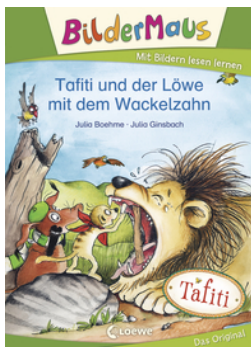
PictureMouse - Tafiti and the Lion with the Wobbly Tooth