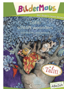
Picture Mouse - Tafiti Sleeps Somewhere Else