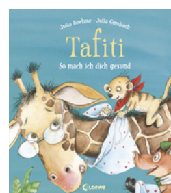
Tafiti – That's How You Get Well