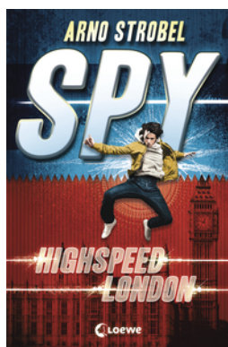
SPY - Highspeed London (Vol.1)