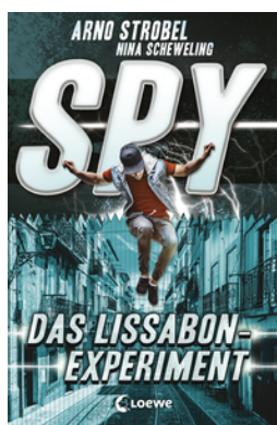
Spy - The Lisbon Experiment (Vol. 5)