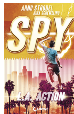
SPY - L.A. Action (Vol.4)