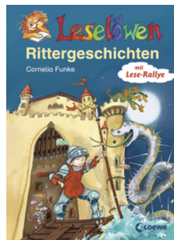
Reading Lions - Knight Stories