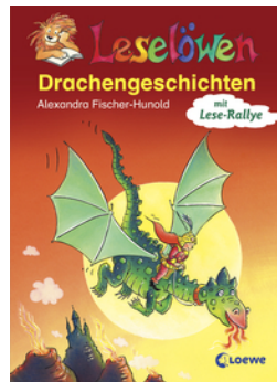
Reading Lions - Dragon Stories