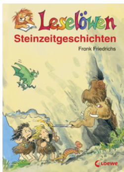
Stone Age Stories