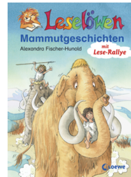
Reading Lions - Mammoth Stories