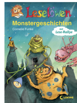
Reading Lion Monster Stories (Relaunch)