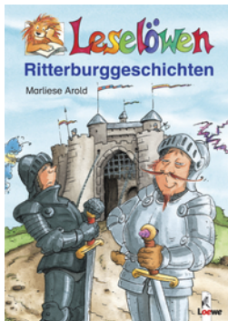
Knight's Castle Stories