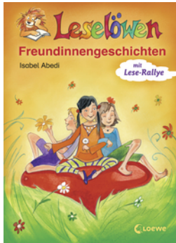
Reading Lions - Girl Friend Stories