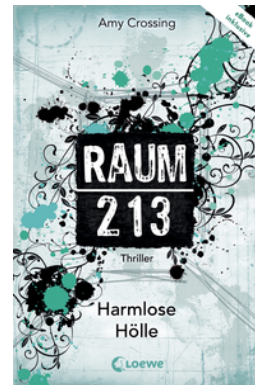
Room 213 – Harmless Hell