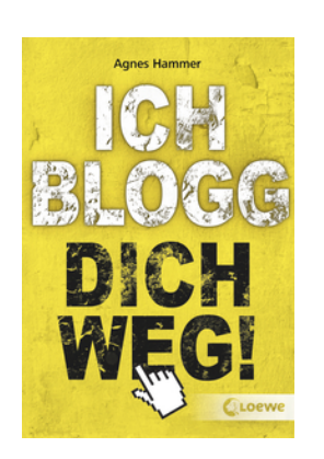
I'll Blog You Away!