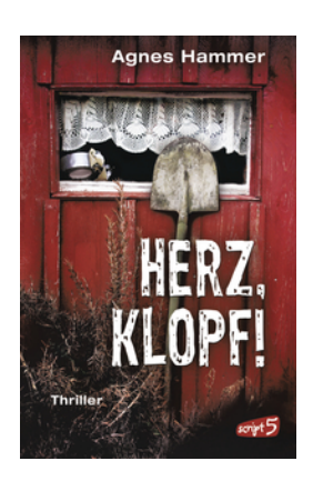
A Beating Heart