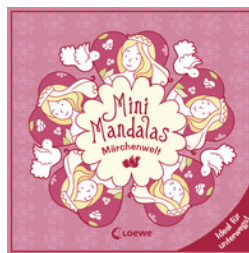
Mini Mandalas - Fairy Tale World