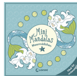
Mini Mandalas - Mermaids