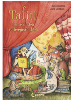
Tafiti – The Best Story Time Adventures for Reading Together