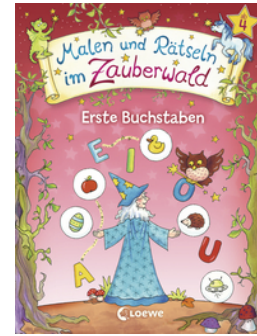
Drawing and Puzzle-solving in the Enchanted Forest - First Letters