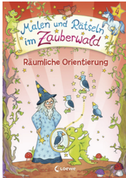
Drawing and Quiz-Solving in the Enchanted Forest - Spatial Orientation