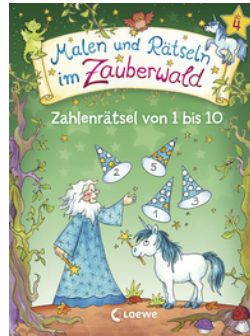
Drawing and Puzzle-solving in the Enchanted Forest - Number Puzzles from 1 to 10