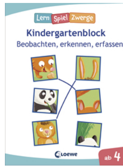
Little Quiz Dwarfs - Perception