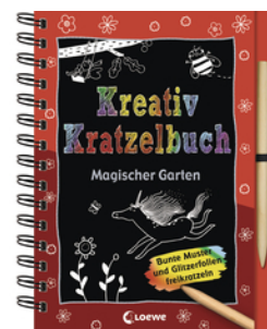
Creative Scratch Book - Magical Garden