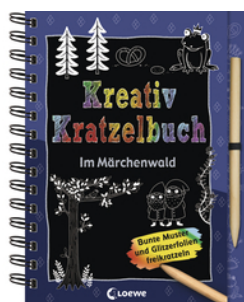
Creative Scratching - Tales' Forest