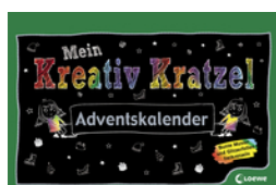
Creative Scratching: Advent Calendar