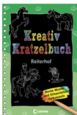
Creative Scratch Book - Riding School