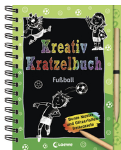
Creative Scratch Book - Soccer