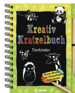
Creative Scratching - Animal Kids