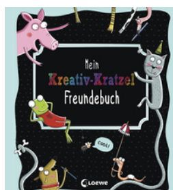
Creative Scratching Friendship Album