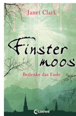
Finstermoss – Reflect Upon the End (Vol. 4)