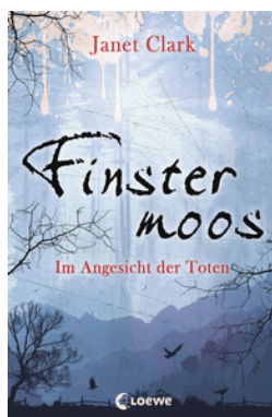
Finstermoss – At Death's Door (Vol. 3)