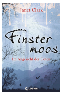
Finstermoos – At Death's Door (Vol. 3)