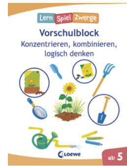
Little Quiz Dwarfs - Logic Games