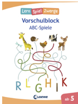
Little Quiz Dwarfs - ABC Games