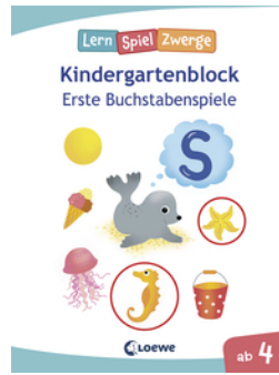
Little Quiz Dwarfs - First Letter Games