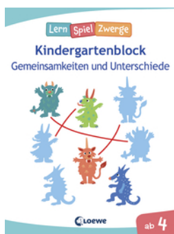
Little Quiz Dwarfs - Similarities and Differences