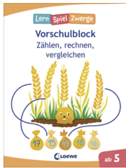
Little Quiz Dwarfs - Counting, Calculating, Comparing