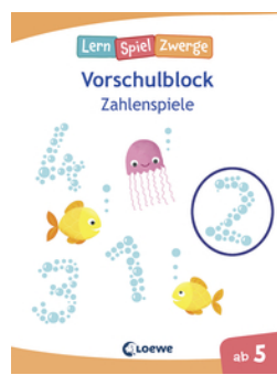
Little Quiz Dwarfs - Number Games