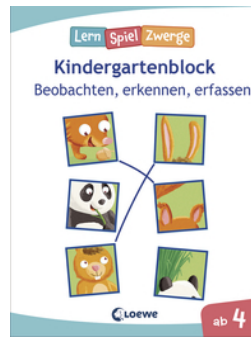
Little Quiz Dwarfs - Perception