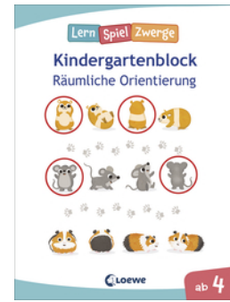
Little Quiz Dwarfs - Spatial Orientation