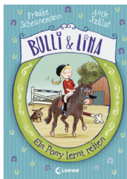
Bulli and Lina - A Pony Learns to Ride (Vol. 2)