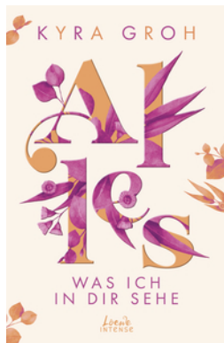
All That I See In You