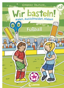
Let's Do Arts and Crafts! - Football