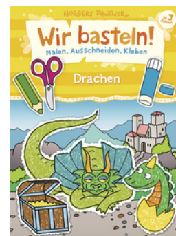
Let's Do Arts & Crafts! - Dragons