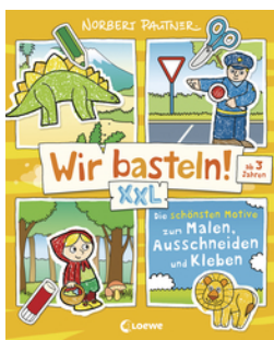
Let's do Arts and Crafts! XXL - The most beautiful designs to paint, cut out and glue (yellow)