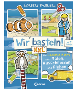
Let's Do Arts & Crafts! XXL - The most beautiful designs to paint, cut out and glue (blue)