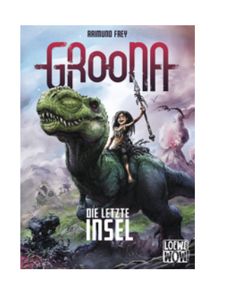
Groona – The Last Island (Vol. 1)

Loewe Verlag GmbH Bühlstraße 4 95463 Bindlach