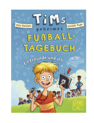
Tim's Secret Soccer Diary – 11 Friends and I (Vol.1)