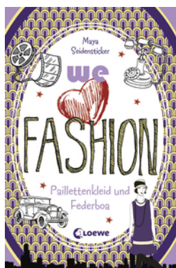
We Love Fashion – Sequined Dress and Feather Boa (Vol. 3)