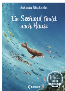
The Secret Life of Animals - Minik: A Seal Finds its Way Home (Ozean, Vol. 4)