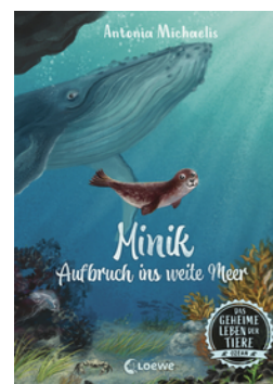
The Secret Life of Animals – Minik's Departure Into the Wide Sea (Ocean, Vol. 1)