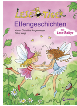
Reading Tiger Fairy Stories