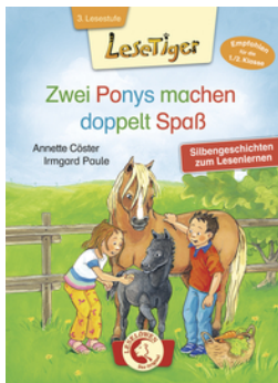
Reading Tiger: Two Ponies are Twice the Fun