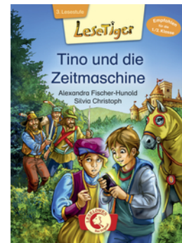
Reading Tiger: Tino and The Time Mashine