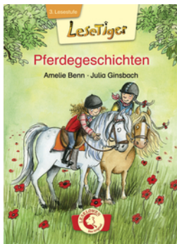
Reading Tiger - Horse Tales