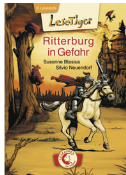
Reading Pirates - Knight's Castle in Danger