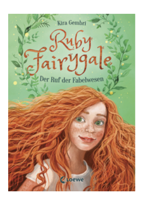
Ruby Fairygale (Vol. 1) Call of the Mythical Creatures