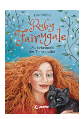
Ruby Fairygale (Vol. 3) The Animal Shifter's Secret