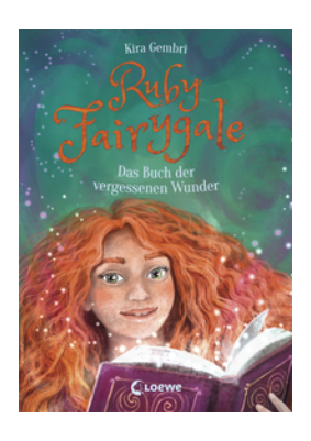
Ruby Fairy Gale (Vol. 8) The Book of Forgotten Wonders