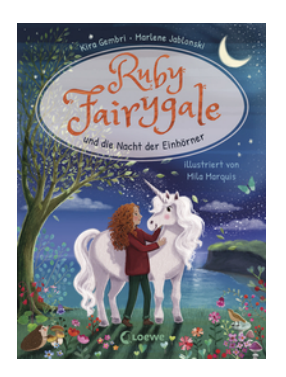
Ruby Fairygail And the Night of the Unicorns (Vol. 4)