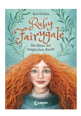
Ruby Fairygale (Vol. 2) Guardians of the Magic Bay