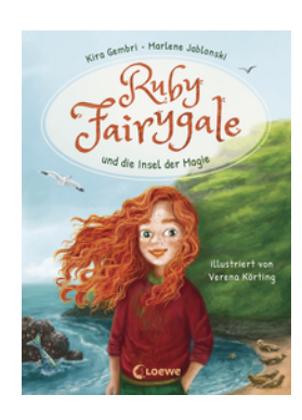
Ruby Fairygale And the Island of Magic (Vol. 1)