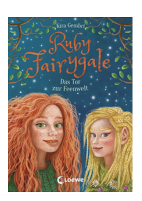
Ruby Fairygale (Vol. 4) Gate to the Fairy World