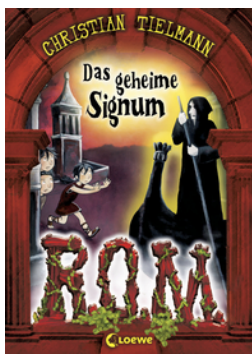
R.O.M. - The Secret Signum (Vol. 2)