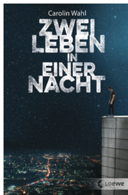
Two Lives in One Night