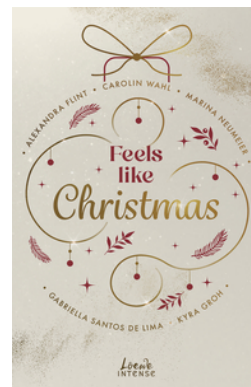
Feels Like Christmas