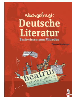
Guide to German Literature