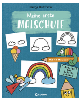
My First Drawing School