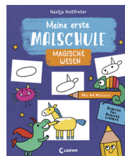
My First Drawing School - Magical Creatures