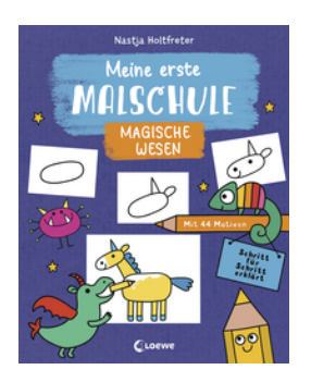
My First Drawing School - Magical Creatures