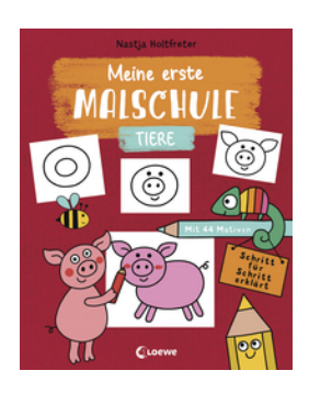
My First Drawing School - Animals