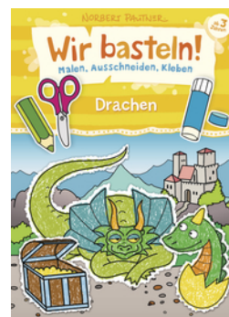
Let's Do Arts & Crafts! - Dragons