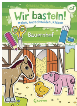
Let's Do Arts and Crafts! - Farm