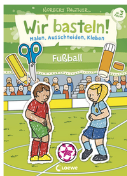
Let's Do Arts and Crafts! - Football