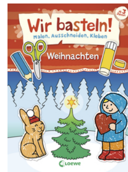
Let's Do Arts & Crafts! - Christmas