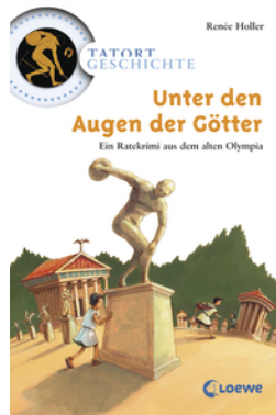
History Mysteries - Under the Eyes of the Gods