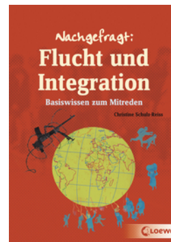
Guide to Refugee Migration and Integration