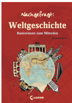
Guide to World History