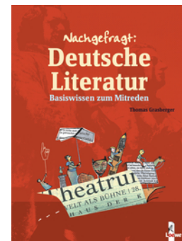
Guide to German Literature