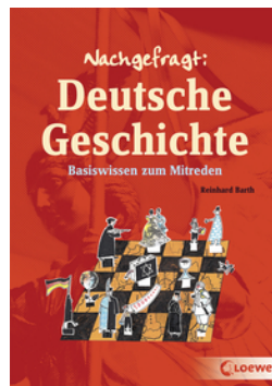
Guide to German History