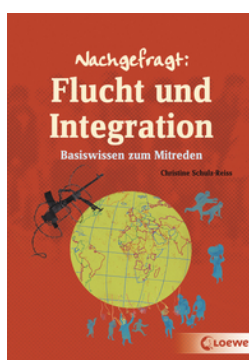
Guide to Refugee Migration and Integration