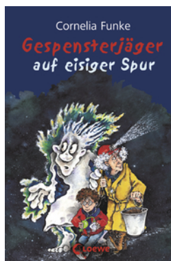
Ghost Hunters and the Incredibly Revolting Ghost