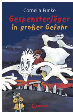
Ghosthunters and the Muddy Monster of Doom