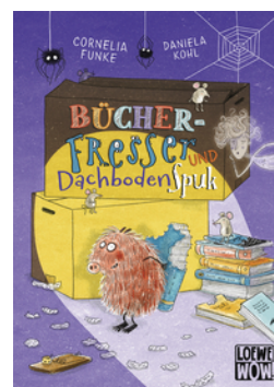
Book Crunchers and Attic Hauntings