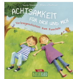
Attentiveness for All of Us! – Story Time is Cuddle Time!