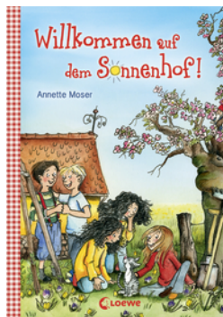
Sunny Farm – Welcome to Sunny Farm! (Vol. 1)