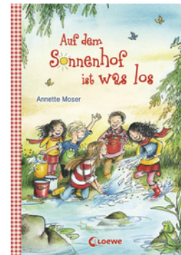
Sunny Farm – Something's up on Sunny Farm (Vol. 3)