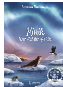
The Secret Life of Animals – Minik: Call of the Arctic (Ocean, Vol. 2)