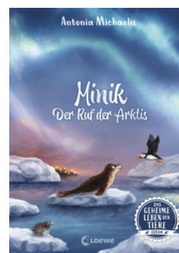
The Secret Life of Animals – Minik: Call of the Arctic (Ocean, Vol. 2)