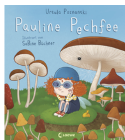
Pauline the Flop-Fairy