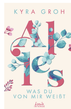
All That You Know About Me