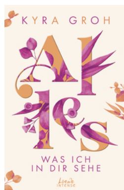
All That I See In You