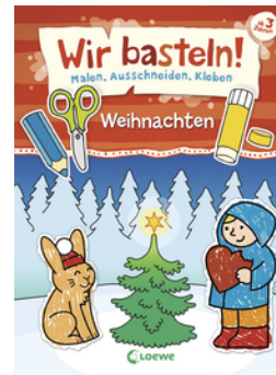
Let's Do Arts & Crafts! - Christmas