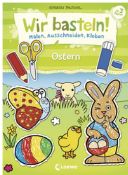
Let's Do Arts and Crafts! - Easter