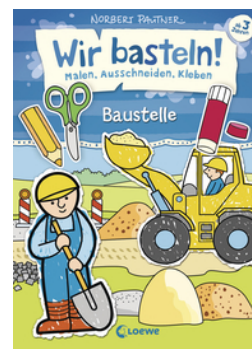
Let's Do Arts and Crafts! - Construction Site