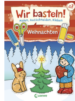
Let's Do Arts & Crafts! - Christmas