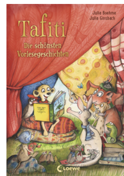
Tafiti – The Best Story Time Adventures for Reading Together