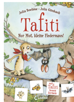
Tafiti – Be Brave, Little Bat!