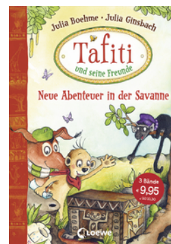
Tafiti and His Friends - New Adventures in the Savannah (Vol. 4-6)