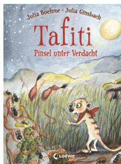
Tafiti - Pinsel unter Suspicion (Vol. 22)