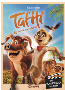
Tafiti Off Into the Desert