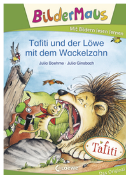
PictureMouse - Tafiti and the Lion with the Wobbly Tooth