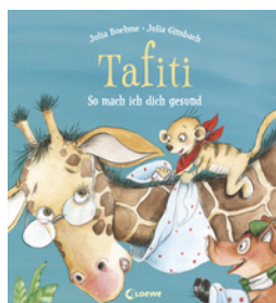
Tafiti – That's How You Get Well