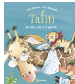
Tafiti – That's How You Get Well