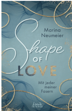
Shape of Love – With Every One of My Fibres