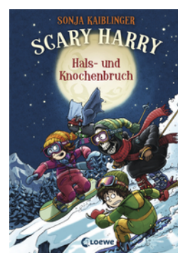
Scary Harry – Break a Legbone (Vol. 6)