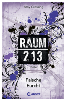
Room 213 – False Fear