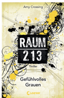
Room 213 – Emotional Horror