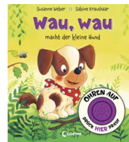
The Dog Says "Woof Woof"