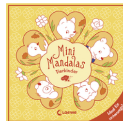
Mini Mandalas - Animal Babies