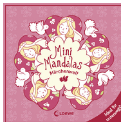
Mini Mandalas - Fairy Tale World