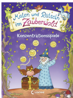
Drawing and Quiz-Solving in the Enchanted Forest - Concentration