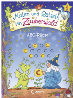
Drawing and Puzzle-solving in the Enchanted Forest - ABC-Quiz