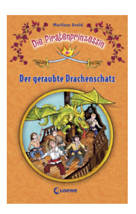
The Pirate Princess - The Stolen Dragon's Treasure (Vol 2)