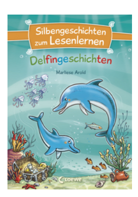
Syllable Stories for Learning to Read - Dolphin Stories