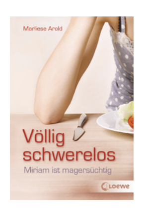
Absolutely Weightless – Miriam Is Anorexic