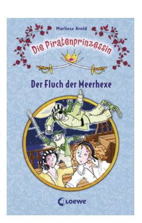
The Pirate Princess - The Curse of the Sea Witch (Vol. 3)