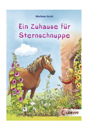
A Home for Shooting Star