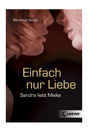
Simply Love - Sandra Loves Meike