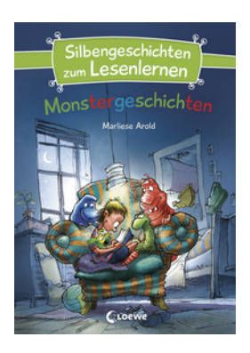
Syllable Stories for Learning to Read - Monster Stories