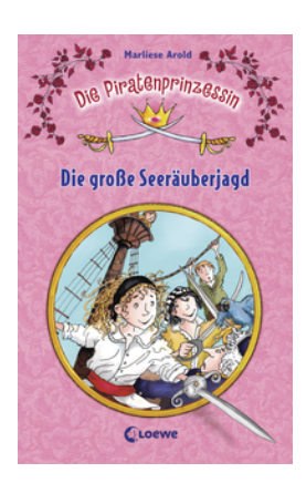
The Pirate Princess - The Great Pirate Hunt (Vol 1)